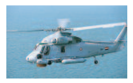
Our SH-2G Super Seasprite naval helicopter, now in service with Egypt, New Zealand and Poland.

Kaman also continued to make progress toward completion of the 11 SH-2G(A) helicopters for the Australia program. Due to the complexity of the integration process and testing results that indicate additional work to be done, the corporation recorded an additional $5.5 million accrued contract loss during the year to reflect the current estimate of costs to complete the program. The Australian government provisionally accepted eight of the helicopters in 2004, and the corporation currently expects to deliver the first fully operational aircraft by mid-year 2005 followed by the final acceptance process for all eleven aircraft.