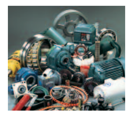
Kaman distributes over one million maintenance & repair and original equipment items to more than 50,000 customers.

PROGRESS Kaman continued to expand its geographic footprint in 2004. New branches were opened in Toronto and Oklahoma City, and the corporation acquired Brivsa de Mexico, a small Monterey, Mexico, distributor that enhances the corporation's ability to serve