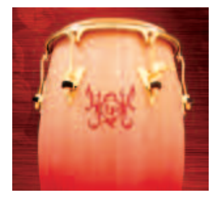
Kaman's Latin Percussion lines lead the market for hand percussion instruments.

PROGRESS Among the year's highlights was the introduction of the Ovation LX series premium guitar, which is receiving high acceptance ratings from players and positive reviews in the national music trade press. The LX series has had a meaningful impact on our sales of U.S. manufactured Ovation guitars. In addition, the competitive positioning of our other brand name or exclusive distribution products such as our Takamine, Adamas and Hamer guitars; and Latin Percussion, Toca and Gretsch drums and other percussion products helped to make 2004 a record sales year.